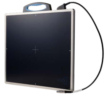
Configuration Detector FXRD-1417SA/B System Control Unit FXRS-02A Designed and manufactured by Vieworks in Korea